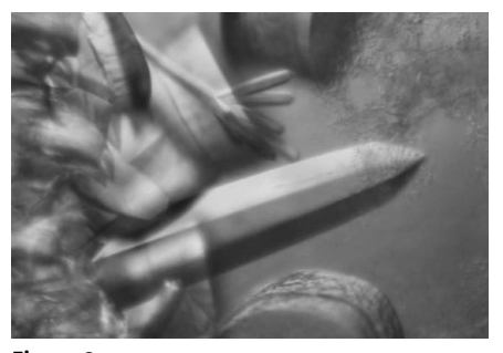
Figure 3 A native His<sub>6</sub>-Aes crystal of dimensions 0.6 \times 0.06 \times 0.06 mm grown in space group P4_x (see §3).

We have expressed Aes in E. coli BRE1162 strain as an N-terminally His<sub>6</sub>-tagged protein. His<sub>6</sub>-Aes was purified to nearhomogeneity as determined by SDS–PAGE analysis (data not shown) and crystallized at 5 mg ml<sup>-1</sup> with the hanging-drop method. The crystals had dimensions of about 0.2 × 0.15 × 0.05 mm (Fig. 1). A native data set was collected to 2.4 Å resolution and the raw data were processed with the program XDS (Kabsch, 1993). The space group was determined to be R 32, with one molecule per asymmetric unit (Table 1). It is inter-