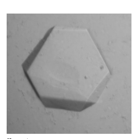
Figure 1 A native His<sub>6</sub>-Aes crystal of dimensions 0.2 \times 0.2 \times 0.05 mm grown in space group R 32 (see §2).

Initial screening was performed using Crystal Screen I (Jancarik & Kim, 1991) and Crystal Screen II (Hampton Research) at 291 K in 96-well sitting-drop plates (Hampton Research). Small crystals of dimensions 0.05 \times 0.05 \times 0.02 mm were obtained with Crystal Screen I, condition No. 22. Further refinement yielded crystals of dimensions 0.2 \times 0.2 \times 0.03 mm in