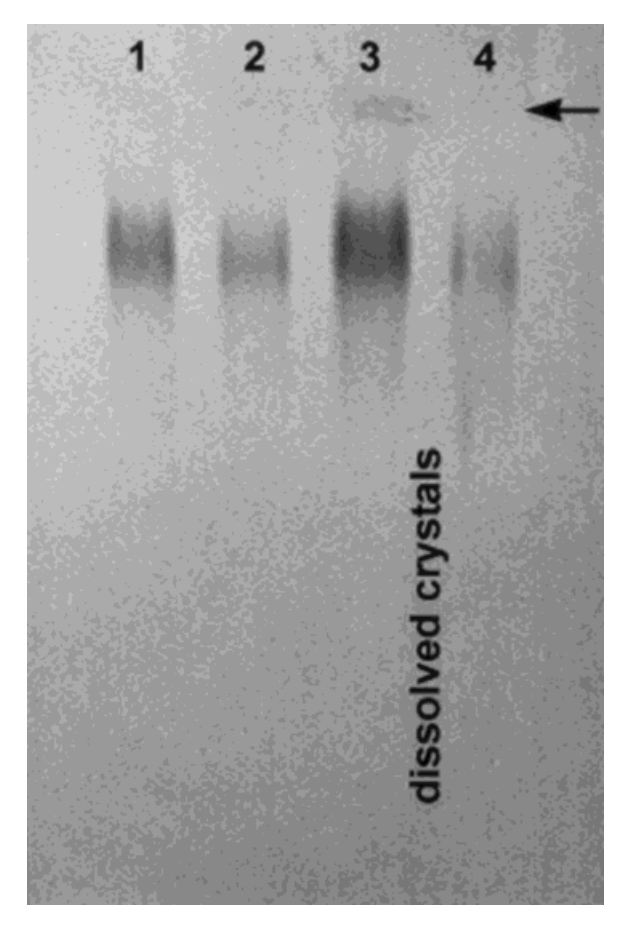
Fig. 1. Agarose gel electrophoresis and immunoblotting (anti apoB) of dissolved LDL crystals (lanes 3 and 4). The control lanes show native LDL solutions in the following dilutions: lane 1: LDL-5, 2 \mu g/ml, lane 2: LDL-2, 0.5 \mu g/ml. The sample application slot is marked by an arrow.

nondichroitic crystals after 1 day, which grew to a size of 80\times80\times50~\mu m^3 after 3 weeks.